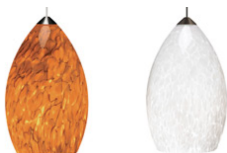
tahoe pine amber