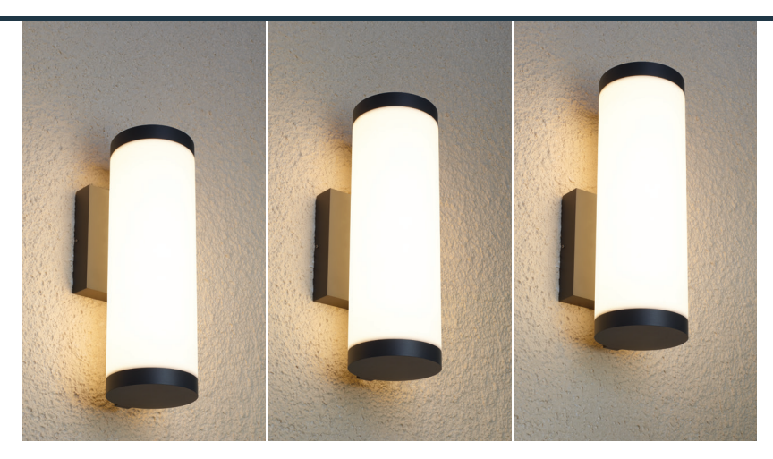
Integrated height adjustment system allows you to customize the fixture position. Low, Mid, or High.