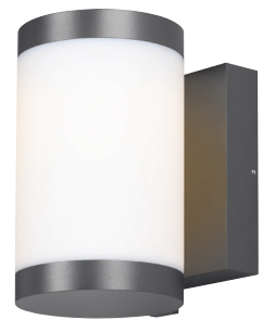
GAGE 8 shown in charcoal