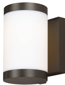
GAGE 8 shown in bronze

* Visit techlighting.com for specific warranty limitations and details.