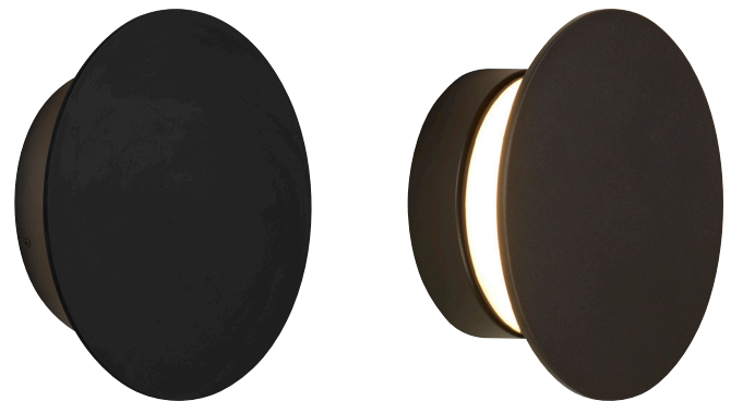
PORT 13 ROUND shown in black

* Visit techlighting.com for specific warranty limitations and details.