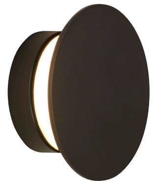
PORT 13 ROUND shown in bronze