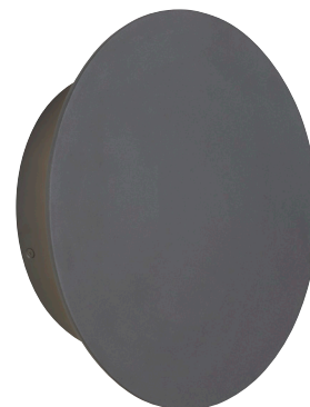
PORT 13 ROUND shown in charcoal