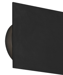
PORT 8 SQUARE shown in black