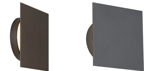
PORT 8 SQUARE shown in bronze

* Visit techlighting.com for specific warranty limitations and details.