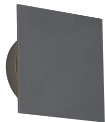
PORT 8 SQUARE shown in charcoal