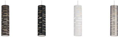
antique bronze gloss black gloss white satin nickel