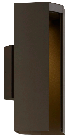
ROOT 15 shown in bronze

* Visit techlighting.com for specific warranty limitations and details.