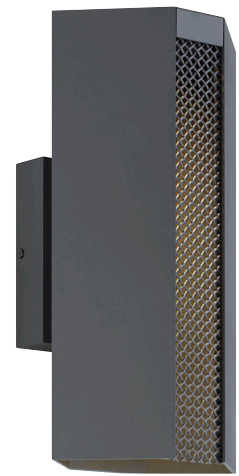
ROOT 15 shown in charcoal (wire mesh shown)