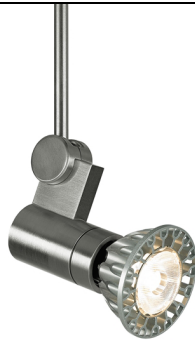
with soraa led lamp