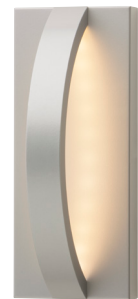
HUNTER 10 shown in silver