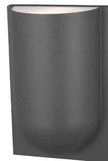
SAVINO 1 LARGE shown in charcoal