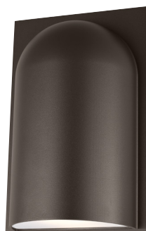
SAVINO 1 LARGE shown in bronze

* Visit techlighting.com for specific warranty limitations and details.